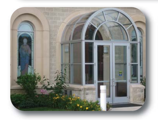
9000 series 1-3/4" x 4-1/2" This center set, flush glazed framing system was developed for 1/4" glass or other types of infill panel of varying thicknesses.